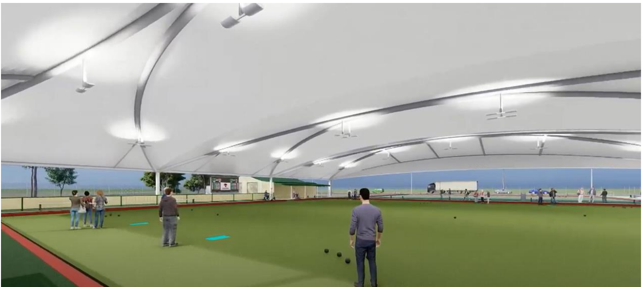
Figure 1: Lightweight Structures (WA) Australia - Concept drawing view from underneath canopy

The Pinjarra Bowling & Recreation Club is excited to be building a new, high tensile, all-weather bowling green canopy over "A" Green, with initial works due to commence in August 2024 and construction completed by February 2025. The canopy will enable all year, day and night bowling, in all weather conditions, plus guaranteed event scheduling which will 'future proof' competitive and social activities at Pinjarra.